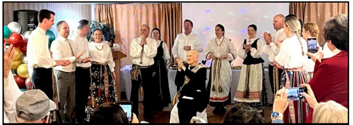
Malunas Dance Group take a break after their performance.