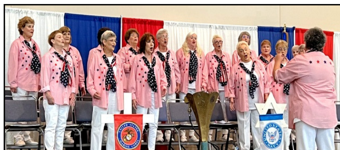
Delmarva Chorus singing at the Memorial Service.