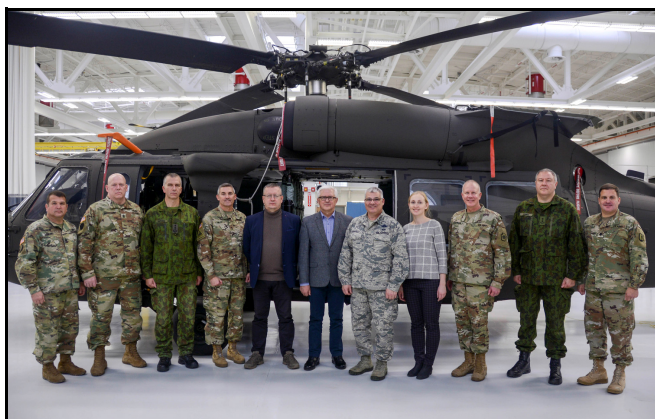
Lithuanian delegation poses in front of UH-60 Black Hawk helicopter prior to aerial tour of Fort Indiantown Gap.

“The Lithuanian Armed Forces have begun the process of increasing their rotary wing aircraft capabilities. As the Pennsylvania National Guard's partner in the State Partnership Program, the Lithuanian delegation came to the EAATS to learn more about the Pennsylvania National Guard's rotary wing capabilities, extensive training possibilities, and expertise with the UH-60 Black Hawk helicopter in particular.