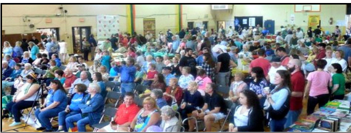
Attendees enjoying the dance performances.