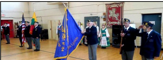
The American Legion Lithuanian Post 154 Color Guard

Maryland's Lithuanian Community had its Lithuanian Festival during the May 14th weekend at the Catonsville Armory. More than 1,200 people enjoyed continuous entertainment by senior, junior and children's Lithuanian Folk Dance Groups. There was plenty of delicious Lithuanian food and drink for all to enjoy.